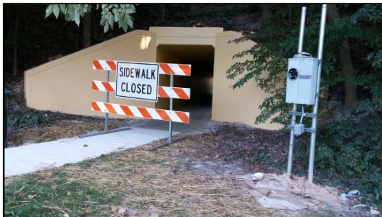
Tunnel Painted Fun Yellow

The sidewalks were repaired in late July and the old lighting removed in early August. On August 25 the Board approved state-of-the-art LED lighting specifically chosen to complement the artwork. We are happy to announce that we will be the first in Greensboro to have this type of lighting.