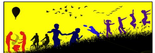
Work and Play Concepts for Mural