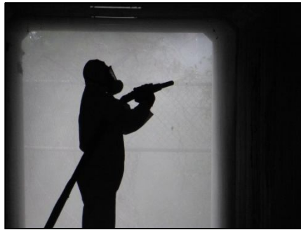
Sandblasting by Southern Paint